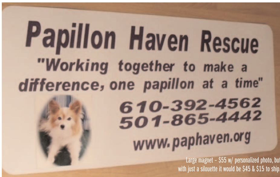
Large magnet - $55 w/ personalized photo, but with just a silhouette it would be $45 & $15 to ship.