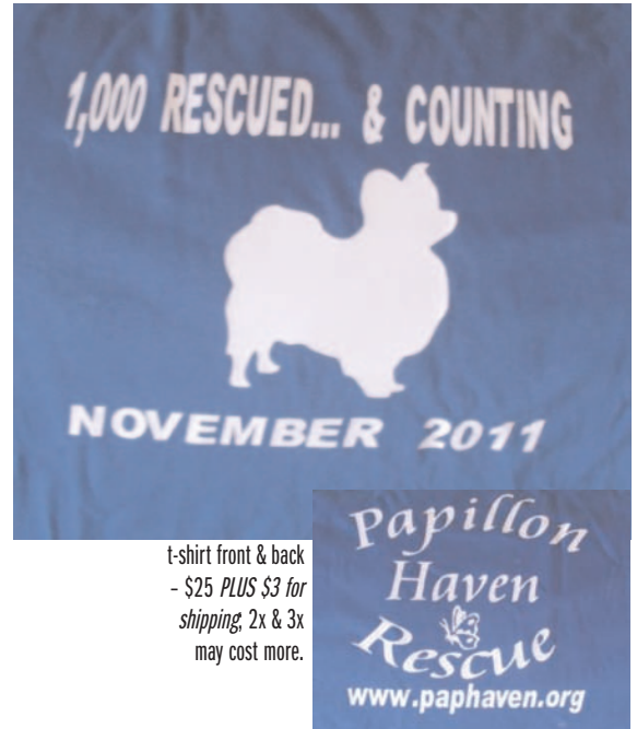
t-shirt front & back - $25 PLUS $3 for shipping, 2x & 3x may cost more.

If you are interested in any of the designs you see here, contact Amy at afretz@ptd.net .