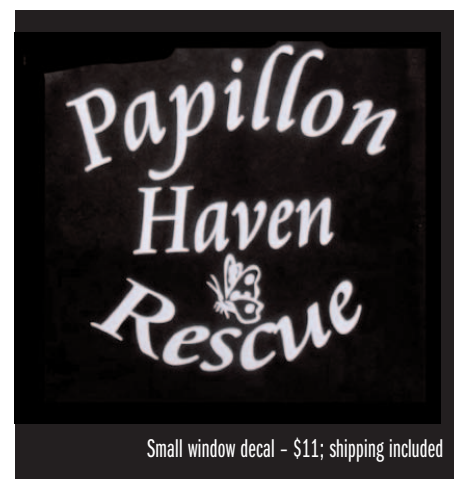
Small window decal - $11; shipping included