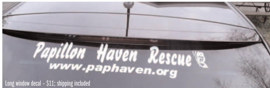
Long window decal - $11; shipping included