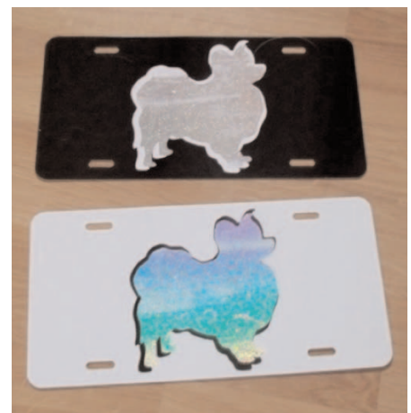
License plates - $15; shipping included.